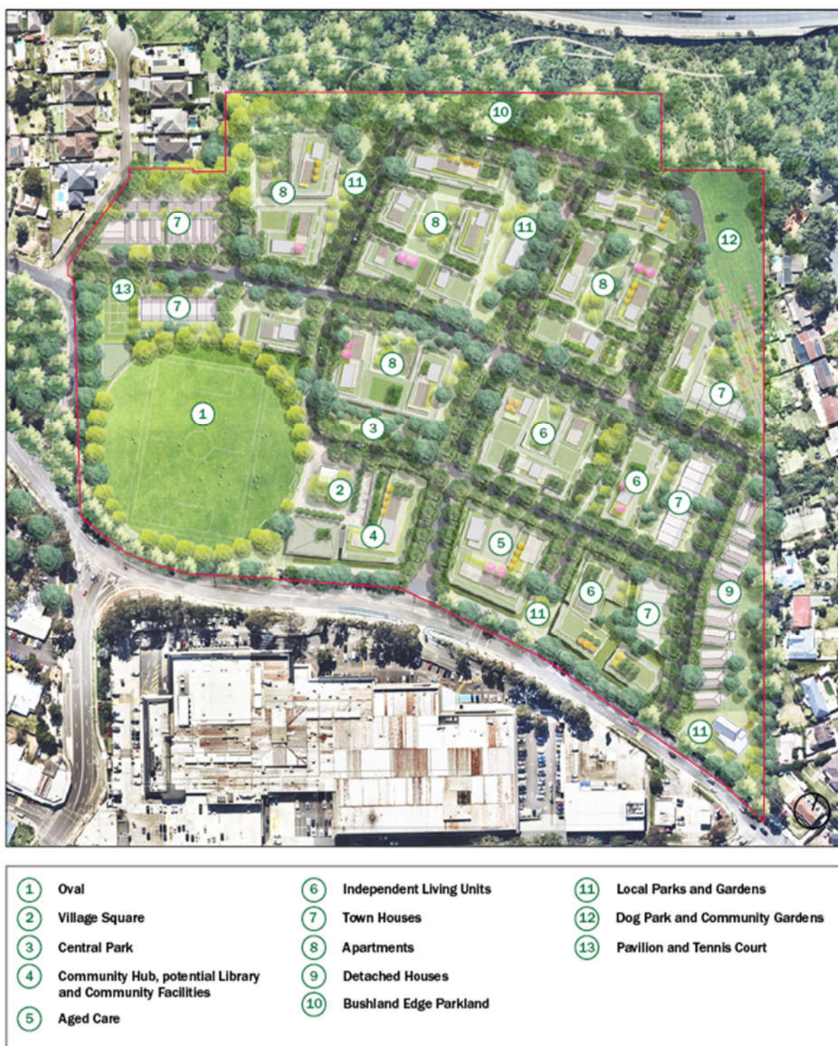
Figure 1 - North Rocks Masterplan